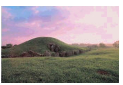
Bryn Celli Ddu, Anglesey, Wales