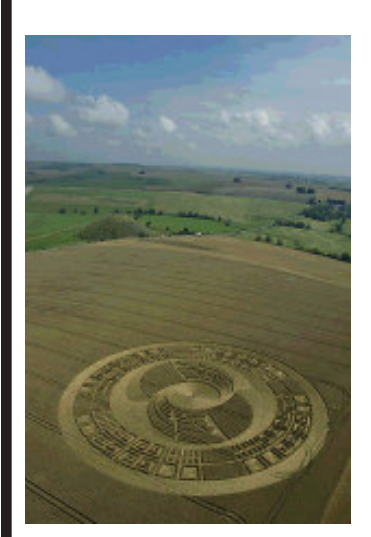
Crop Formation 2004

Wales, Glastonbury, Stonehenge, Avebury, Crop Circles Tintagel & Ancient Sites of Penwith, Cornwall